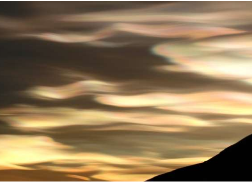
Nacreous Clouds, Ross Island, Antarctica