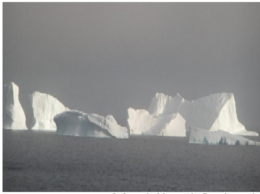
Icebergs in Marguerite Bay, Antarctica